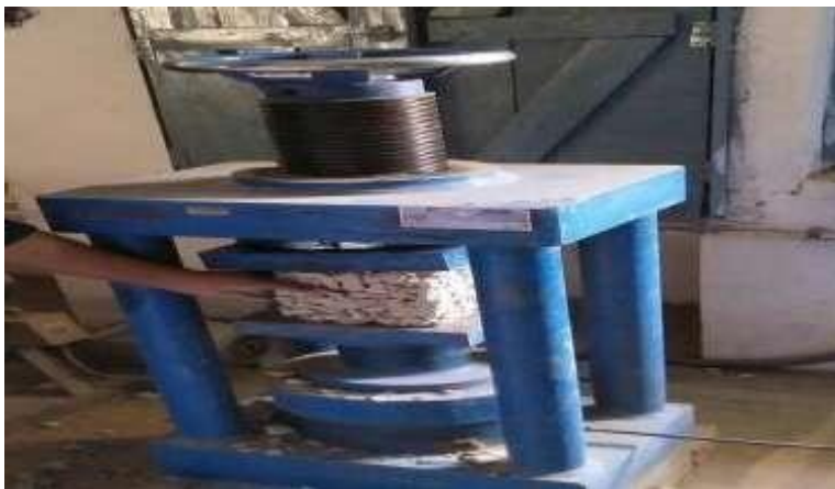
Figure 1 Compression Test of Pervious Concrete

Casting – Casting is generally referred as molding of concrete Mould of size 150mm x 150 mm x150mm are used for compression test of concrete.