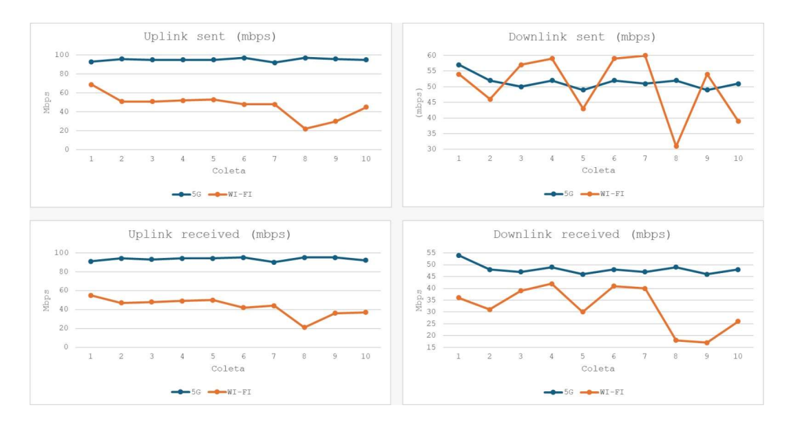
Figure 2 - Measured throughput results (mbps), comparing 5G and WI-FI networks.

The transfer rate, representing the amount of data exchanged between the server and the AMR per unit of time, was evaluated using the Iperf 3 tool. The experiment simulated high-demand scenarios, with 10 simultaneous flows and bandwidth limited to 100 Mbps. Figure 2 shows the results of the Throughput evaluation.